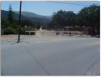
Blocking public access. KC Zoning Code Violation § 19.02.060