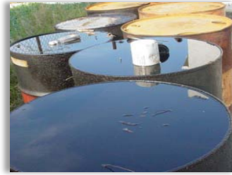
Combustible material stored around the dwelling. KC Solid Waste Code Violation § 8.28.110